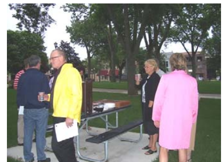
Who's the Lady in Pink