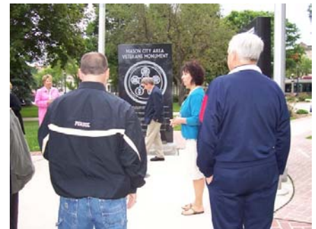
We gather at the Veterans Memorial