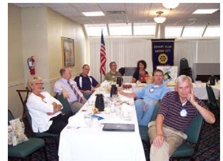
Waiting for the action to begin